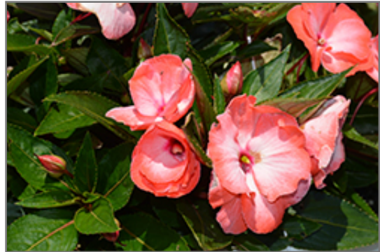
Painted Select Antilla New Guinea Impatiens flowers

Painted Select Antilla New Guinea Impatiens is recommended for the following landscape applications;