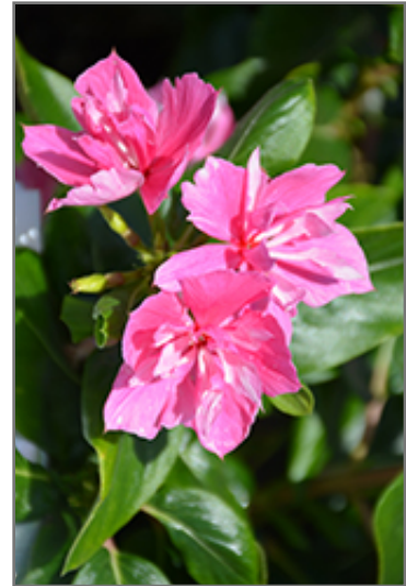
Soiree Double Pink Vinca flowers

This plant will require occasional maintenance and upkeep, and should not require much pruning, except when necessary, such as to remove dieback. It is a good choice for attracting butterflies to your yard, but is not particularly attractive to deer who tend to leave it alone in favor of tastier treats. It has no significant negative characteristics.