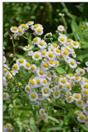
Philidelphia Fleabane flowers