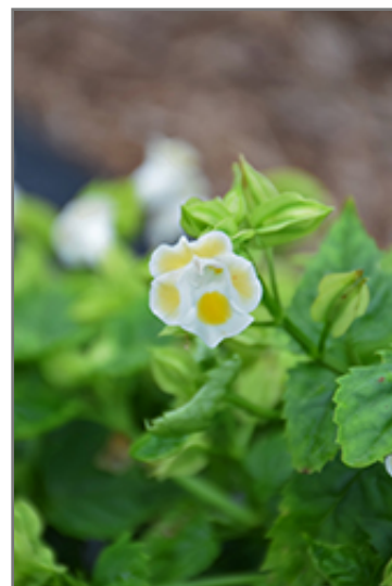
Kauai Lemon Drop Torenia flowers

Kauai Lemon Drop Torenia is recommended for the following landscape applications;