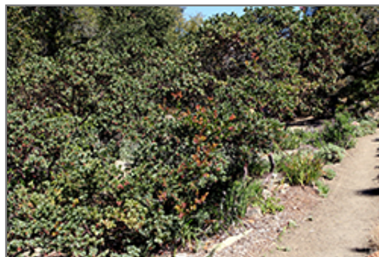
Canyon Blush Manzanita