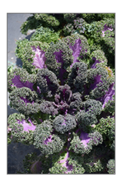
Yokohama Red Ornamental Kale foliage

Yokohama Red Ornamental Kale is recommended for the following landscape applications;