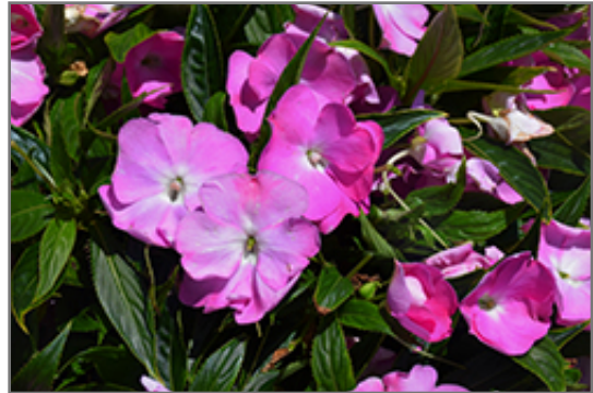
Harmony Colorfall Pink Impatiens flowers