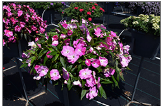
Harmony Colorfall Pink Impatiens in bloom