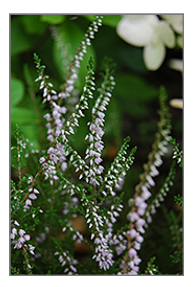
Arina Heather flowers