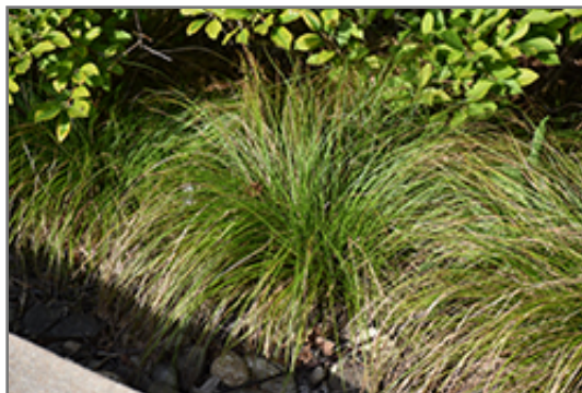
White-tinged Sedge