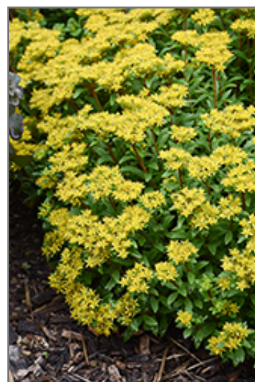
Rock 'N Round Bright Idea Stonecrop in bloom