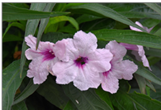
Katie Pink Dwarf Mexican Petunia foliage