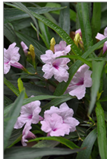
Katie Pink Dwarf Mexican Petunia flowers

This is an herbaceous evergreen houseplant with an upright spreading habit of growth. This plant may benefit from an occasional pruning to look its best.