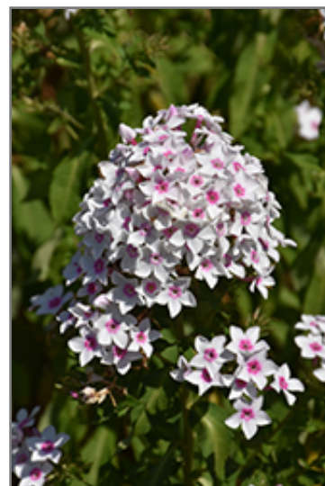
Cherry Cream Garden Phlox flowers