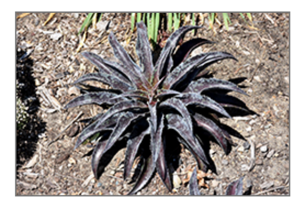
Black Magic Mangave