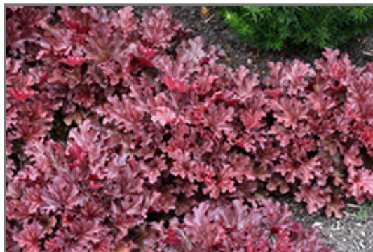
Ruby Tuesday Coral Bells

This is a relatively low maintenance plant, and should be cut back in late fall in preparation for winter. It is a good choice for attracting hummingbirds to your yard. It has no significant negative characteristics.