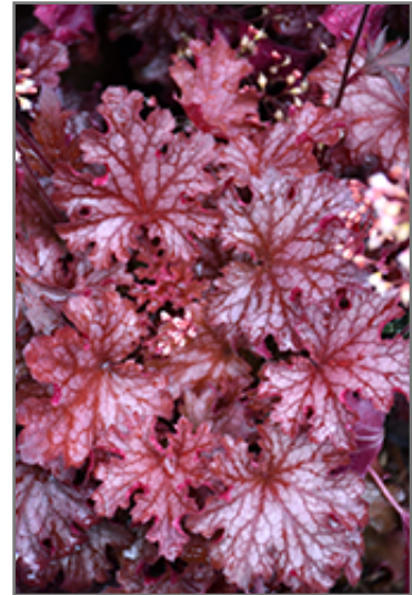
Ruby Tuesday Coral Bells foliage

Ruby Tuesday Coral Bells is a fine choice for the garden, but it is also a good selection for planting in outdoor pots and containers. It is often used as a 'filler' in the 'spiller-thriller-filler' container combination, providing a mass of flowers and foliage against which the larger thriller plants stand out. Note that when growing plants in outdoor containers and baskets, they may require more frequent waterings than they would in the yard or garden.