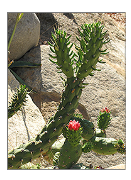
Eve's Needle Cactus foliage

Eve's Needle Cactus is a succulent evergreen plant. It is a member of the cactus family, which are grown primarily for their characteristic shapes, their interesting features and textures, and their high tolerance for hot, dry growing environments. As an 'opuntiad' type of cactus, it doesn't actually have leaves, but rather modified succulent stems that comprise the bulk of the plant, and which are designed to retain water for long periods of time. This particular cactus is valued for its upright and spreading habit of growth on a plant consisting of long, narrow spiny dark green segmented stems that form 'branches' which spread out from a central base. This plant features showy scarlet cup-shaped flowers at the ends of the branches from mid spring to early summer.