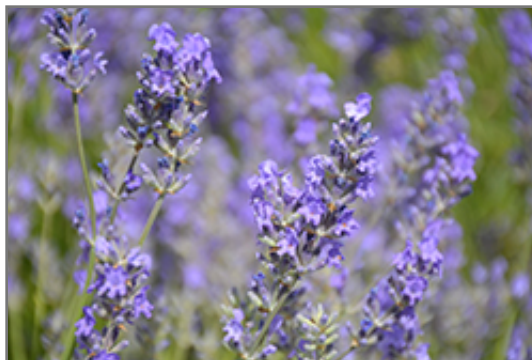
Sachet Lavender flowers

Sachet Lavender is a dense multi-stemmed evergreen shrub with a mounded form. It lends an extremely fine and delicate texture to the landscape composition which should be used to full effect.