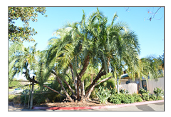
Senegal Date Palm