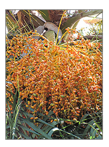
Senegal Date Palm fruit

This tree does best in full sun to partial shade. It does best in average to evenly moist conditions, but will not tolerate standing water. It is not particular as to soil type or pH, and is able to handle environmental salt. It is somewhat tolerant of urban pollution. This species is not originally from North America.