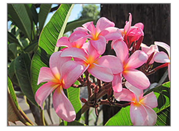
Pink Frangipani flowers

Pink Frangipani features showy clusters of fragrant rose trumpet-shaped flowers with pink overtones and gold throats at the ends of the branches from early spring to mid fall, which emerge from distinctive crimson flower buds. Its pointy leaves remain dark green in color with curious light green undersides throughout the year.