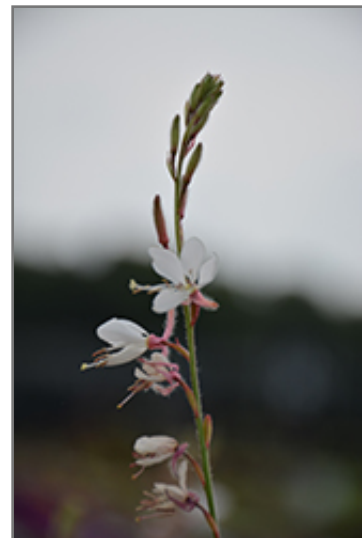
Grace Haze Gaura flowers

This is a relatively low maintenance plant, and is best cleaned up in early spring before it resumes active growth for the season. It is a good choice for attracting butterflies to your yard, but is not particularly attractive to deer who tend to leave it alone in favor of tastier treats. It has no significant negative characteristics.