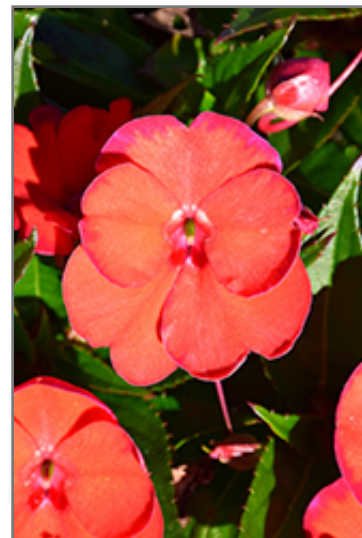
SunStanding Orange Aurora Impatiens flowers

SunStanding Orange Aurora Impatiens is recommended for the following landscape applications;