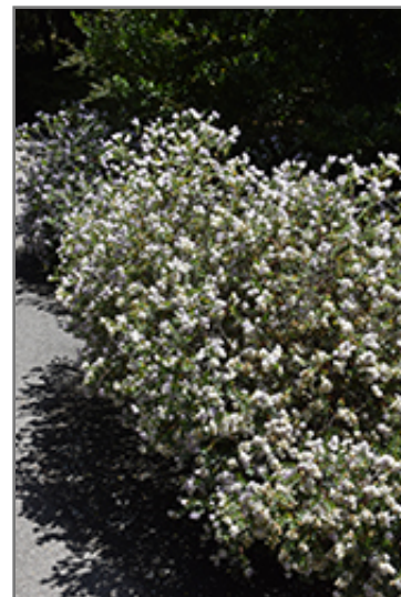
Western Hills Hebe in bloom