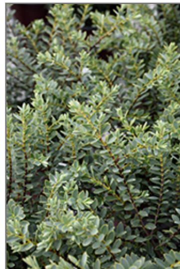
Western Hills Hebe foliage

Western Hills Hebe makes a fine choice for the outdoor landscape, but it is also well-suited for use in outdoor pots and containers. With its upright habit of growth, it is best suited for use as a 'thriller' in the 'spiller-thriller-filler' container combination; plant it near the center of the pot, surrounded by smaller plants and those that spill over the edges. It is even sizeable enough that it can be grown alone in a suitable container. Note that when grown in a container, it may not perform exactly as indicated on the tag - this is to be expected. Also note that when growing plants in outdoor containers and baskets, they may require more frequent waterings than they would in the yard or garden.