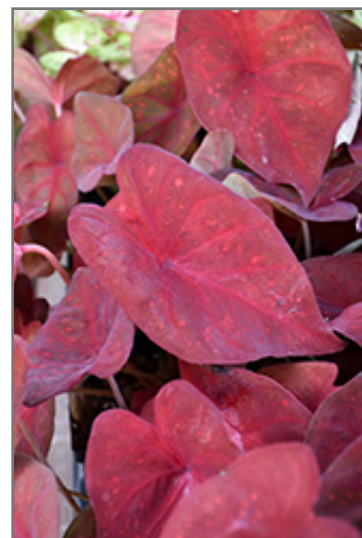
Burning Heart Caladium foliage

Burning Heart Caladium is recommended for the following landscape applications;