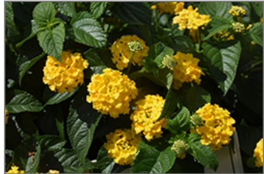
Lucky Yellow Lantana flowers

Lucky Yellow Lantana is recommended for the following landscape applications;