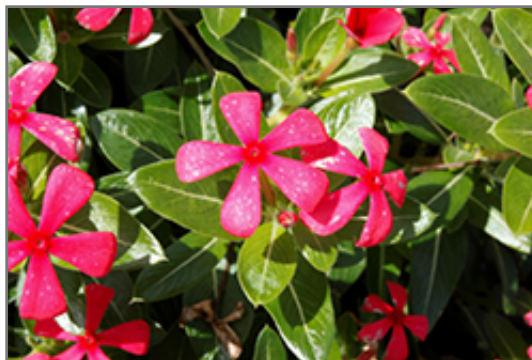
Soiree Kawaii Red Shades Vinca flowers

Soiree Kawaii Red Shades Vinca is a dense herbaceous annual with a trailing habit of growth, eventually spilling over the edges of hanging baskets and containers. Its medium texture blends into the garden, but can always be balanced by a couple of finer or coarser plants for an effective composition.