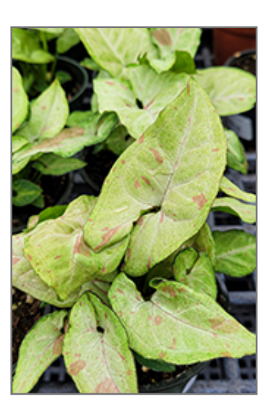
Confetti Arrowhead Vine foliage

When grown indoors, Confetti Arrowhead Vine can be expected to grow to be about 14 inches tall at maturity, with a spread of 8 feet. It grows at a fast rate, and under ideal conditions can be expected to live for approximately 10 years. This houseplant performs well in both bright or indirect sunlight and strong artificial light, and can therefore be situated in almost any well-lit room or location. It prefers to grow in average to moist soil. The surface of the soil shouldn't be allowed to dry out completely, and so you should expect to water this plant once and possibly even twice each week. Be aware that your particular watering schedule may vary depending on its location in the room, the pot size, plant size and other conditions; if in doubt, ask one of our experts in the store for advice. It is not particular as to soil pH, but grows best in rich soil. Contact the store for specific recommendations on pre-mixed potting soil for this plant. Be warned that parts of this plant are known to be toxic to humans and animals, so special care should be exercised if growing it around children and pets.