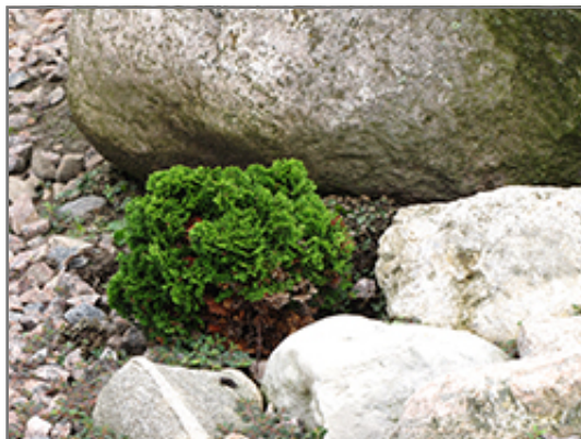
Stoneham Hinoki Falsecypress

Stoneham Hinoki Falsecypress is recommended for the following landscape applications;