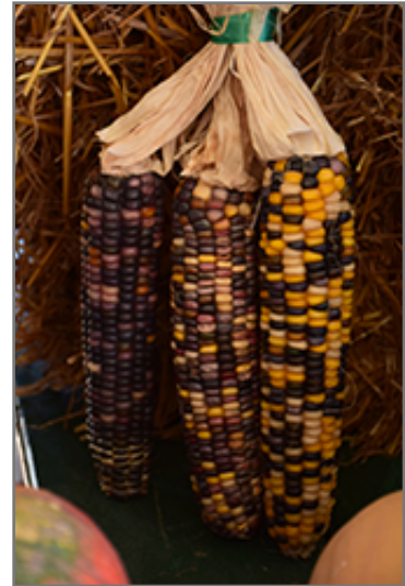
Wilma's Pride Ornamental Corn fruit

This plant is typically grown in a designated vegetable garden. It does best in full sun to partial shade. It prefers to grow in average to moist conditions, and shouldn't be allowed to dry out. It is not particular as to soil type or pH. It is somewhat tolerant of urban pollution. This is a selection of a native North American species.