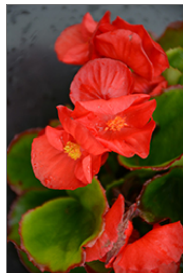
Sprint Plus Red Begonia flowers

This is a high maintenance plant that will require regular care and upkeep, and usually looks its best without pruning, although it will tolerate pruning. Deer don't particularly care for this plant and will usually leave it alone in favor of tastier treats. Gardeners should be aware of the following characteristic(s) that may warrant special consideration;