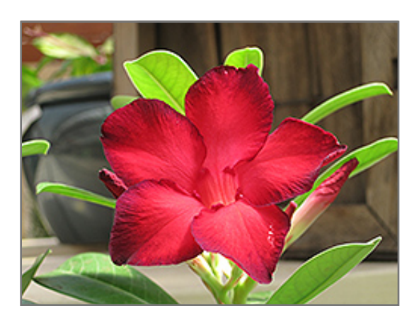
Black Warrior Desert Rose flowers