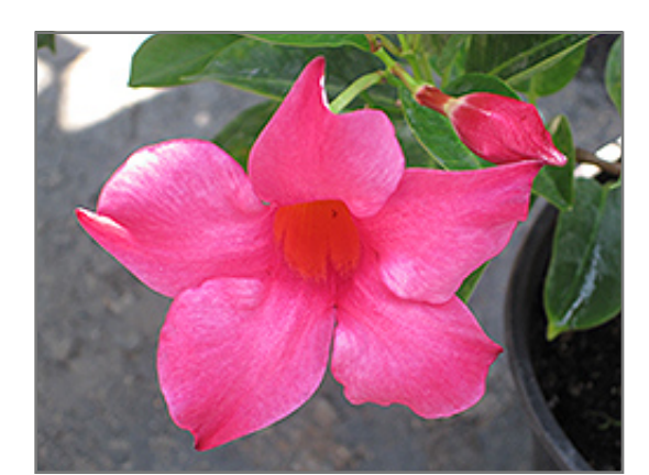
Vogue Rita Mandevilla flowers

When grown indoors, Vogue Rita Mandevilla can be expected to grow to be about 3 feet tall at maturity, with a spread of 24 inches. It grows at a medium rate, and under ideal conditions can be expected to live for approximately 20 years. This houseplant will do well in a location that gets either direct or indirect sunlight, although it will usually require a more brightly-lit environment than what artificial indoor lighting alone can provide. It requires an evenly moist well-drained soil for optimal growth. The surface of the soil shouldn't be allowed to dry out completely, and so you should expect to water this plant once and possibly even twice each week. Be aware that your particular watering schedule may vary depending on its location in the room, the pot size, plant size and other conditions; if in doubt, ask one of our experts in the store for advice. It is not particular as to soil type or pH; an average potting soil should work just fine. Be warned that parts of this plant are known to be toxic to humans and animals, so special care should be exercised if growing it around children and pets.