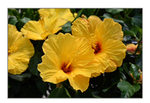
Tahiti Wind Hibiscus flowers