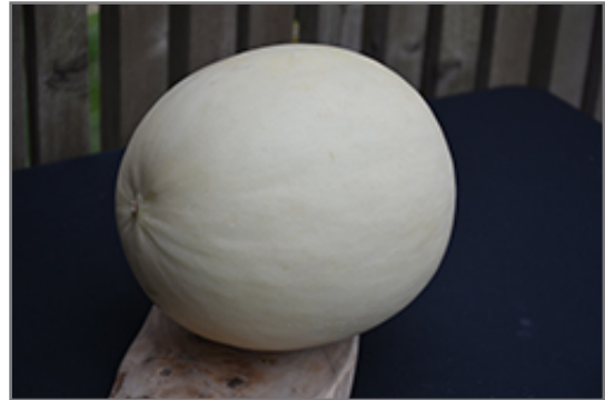
Earli-Dew Honeydew fruit

Earli-Dew Honeydew will grow to be about 18 inches tall at maturity, with a spread of 6 feet. When planted in rows, individual plants should be spaced approximately 3 feet apart. This vegetable plant is an annual, which means that it will grow for one season in your garden and then die after producing a crop.