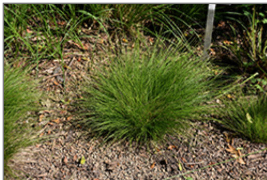
Bristle-leaved Sedge