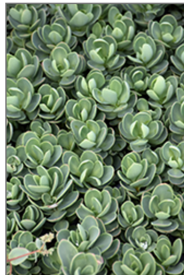
Pink Mongolian Stonecrop foliage

Pink Mongolian Stonecrop is a fine choice for the garden, but it is also a good selection for planting in outdoor pots and containers. It is often used as a 'filler' in the 'spiller-thriller-filler' container combination, providing a mass of flowers and foliage against which the thriller plants stand out. Note that when growing plants in outdoor containers and baskets, they may require more frequent waterings than they would in the yard or garden.