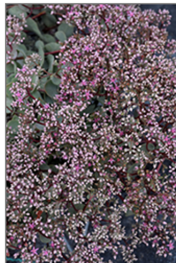
Pink Mongolian Stonecrop flowers