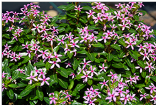
Soiree Kawaii Light Purple Vinca flowers

This plant will require occasional maintenance and upkeep, and should not require much pruning, except when necessary, such as to remove dieback. It is a good choice for attracting butterflies to your yard, but is not particularly attractive to deer who tend to leave it alone in favor of tastier treats. It has no significant negative characteristics.