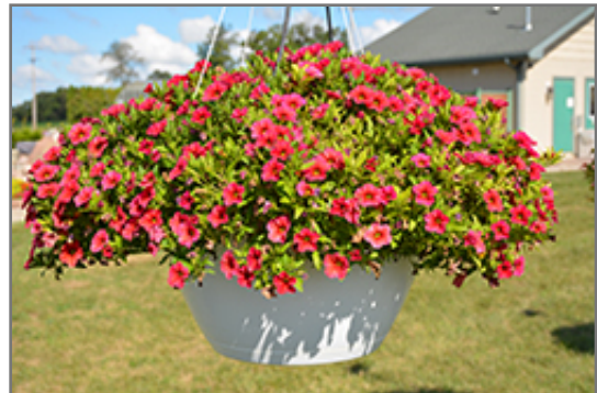
Superbells Tabletop Red Calibrachoa in bloom