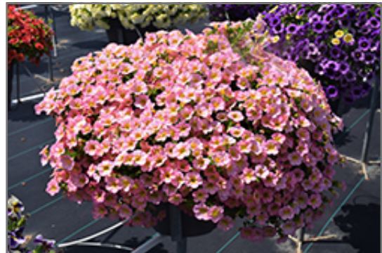
Superbells Honeyberry Calibrachoa in bloom