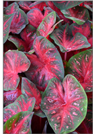
Red Flash Caladium foliage

When grown indoors, Red Flash Caladium can be expected to grow to be about 20 inches tall at maturity, with a spread of 20 inches. It grows at a medium rate, and under ideal conditions can be expected to live for approximately 10 years. This houseplant performs well in both bright or indirect sunlight and strong artificial light, and can therefore be situated in almost any well-lit room or location. It prefers to grow in average to moist soil. The surface of the soil shouldn't be allowed to dry out completely, and so you should expect to water this plant once and possibly even twice each week. Be aware that your particular watering schedule may vary depending on its location in the room, the pot size, plant size and other conditions; if in doubt, ask one of our experts in the store for advice. It is not particular as to soil type or pH; an average potting soil should work just fine.