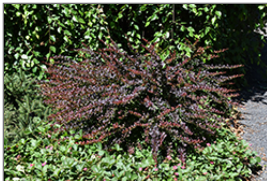
Lava Nugget Barberry