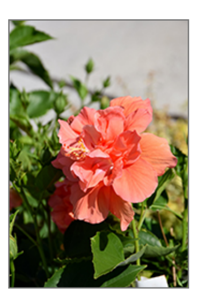
Tangerine Dream Hibiscus flowers

When grown indoors, Tangerine Dream Hibiscus can be expected to grow to be about 4 feet tall at maturity, with a spread of 4 feet. It grows at a fast rate, and under ideal conditions can be expected to live for approximately 5 years. This houseplant will do well in a location that gets either direct or indirect sunlight, although it will usually require a more brightly-lit environment than what artificial indoor lighting alone can provide. It requires an evenly moist well-drained soil for optimal growth, but will suffer if left to grow in standing water. The surface of the soil shouldn't be allowed to dry out completely, and so you should expect to water this plant once and possibly even twice each week. Be aware that your particular watering schedule may vary depending on its location in the room, the pot size, plant size and other conditions; if in doubt, ask one of our experts in the store for advice. It is not particular as to soil pH, but grows best in rich soil. Contact the store for specific recommendations on pre-mixed potting soil for this plant.