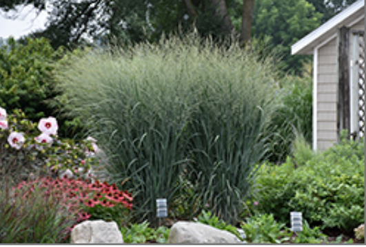
Prairie Winds Totem Pole Switch Grass

Prairie Winds Totem Pole Switch Grass is recommended for the following landscape applications;