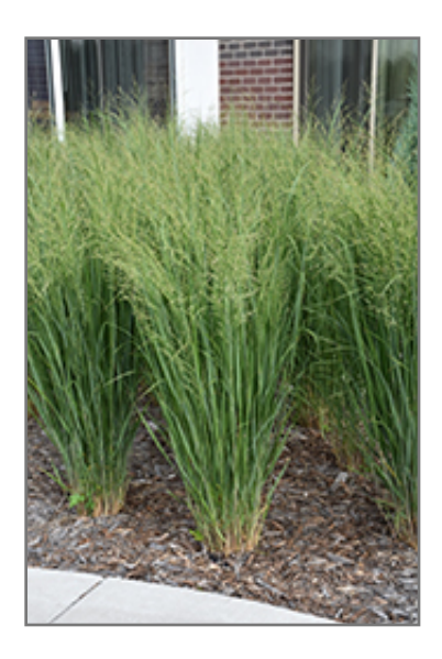
Prairie Winds Totem Pole Switch Grass

This plant does best in full sun to partial shade. It is very adaptable to both dry and moist locations, and should do just fine under typical garden conditions. It is considered to be drought-tolerant, and thus makes an ideal choice for a low-water garden or xeriscape application. It is not particular as to soil type, but has a definite preference for alkaline soils, and is able to handle environmental salt. It is somewhat tolerant of urban pollution. This is a selection of a native North American species. It can be propagated by division; however, as a cultivated variety, be aware that it may be subject to certain restrictions or prohibitions on propagation.