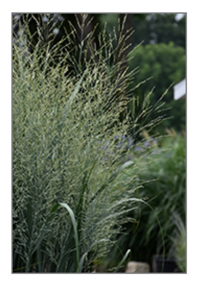
Prairie Winds Totem Pole Switch Grass flowers