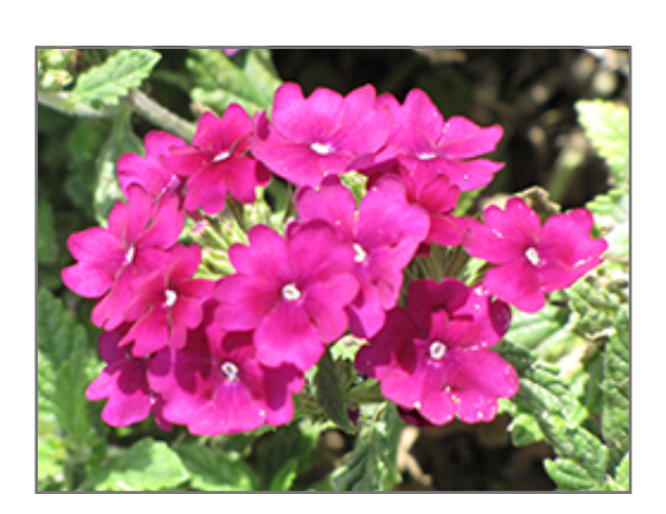
Quartz XP Carmine Rose Verbena flowers

An improved variety that will make outstanding displays in the garden, mixed containers or baskets; mounded and trailing plants present huge clusters of blooms over dark green foliage; pest and disease resistant