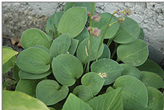
Baby Bunting Hosta foliage