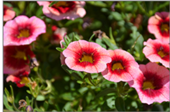
MiniFamous Neo Pink Strike Calibrachoa flowers

MiniFamous Neo Pink Strike Calibrachoa is recommended for the following landscape applications;