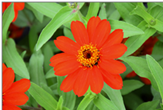
Zahara XL Fire Zinnia flowers

Zahara XL Fire Zinnia is recommended for the following landscape applications;