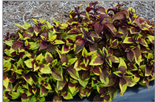
Premium Sun Pineapple Surprise Coleus

Premium Sun Pineapple Surprise Coleus will grow to be about 24 inches tall at maturity, with a spread of 20 inches. When grown in masses or used as a bedding plant, individual plants should be spaced approximately 18 inches apart. Although it's not a true annual, this fast-growing plant can be expected to behave as an annual in our climate if left outdoors over the winter, usually needing replacement the following year. As such, gardeners should take into consideration that it will perform differently than it would in its native habitat.