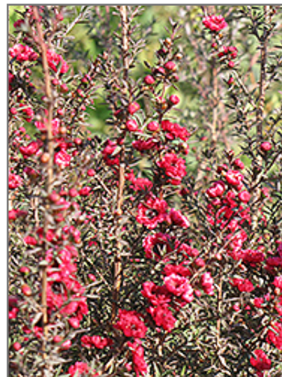
Red Damask Tea-Tree flowers