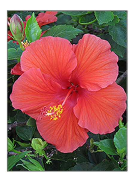
Red Darling Hibiscus

When grown indoors, Red Darling Hibiscus can be expected to grow to be about 6 feet tall at maturity, with a spread of 3 feet. It grows at a fast rate, and under ideal conditions can be expected to live for approximately 5 years. This houseplant will do well in a location that gets either direct or indirect sunlight, although it will usually require a more brightly-lit environment than what artificial indoor lighting alone can provide. It requires an evenly moist well-drained soil for optimal growth, but will suffer if left to grow in standing water. The surface of the soil shouldn't be allowed to dry out completely, and so you should expect to water this plant once and possibly even twice each week. Be aware that your particular watering schedule may vary depending on its location in the room, the pot size, plant size and other conditions; if in doubt, ask one of our experts in the store for advice. It is not particular as to soil pH, but grows best in rich soil. Contact the store for specific recommendations on pre-mixed potting soil for this plant.