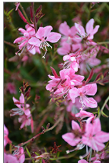
Gaudi Rose Gaura flowers

This is a relatively low maintenance plant, and is best cleaned up in early spring before it resumes active growth for the season. It is a good choice for attracting butterflies to your yard, but is not particularly attractive to deer who tend to leave it alone in favor of tastier treats. It has no significant negative characteristics.