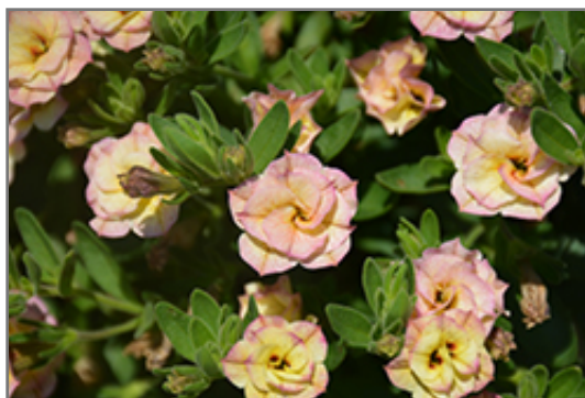
MiniFamous Double Compact Rose Chai Calibrachoa flowers

MiniFamous Double Compact Rose Chai Calibrachoa is recommended for the following landscape applications;